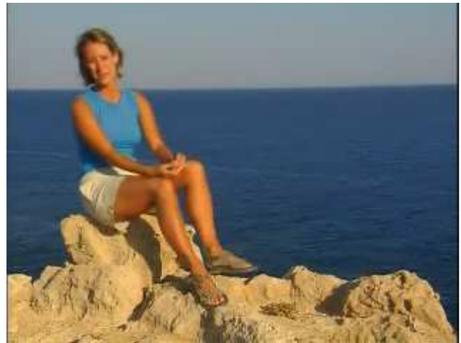
Figure 4: A case of independence : “...I have finally found a place that’s not overrun by tourists...”

Last, figure 4 presents a case of independence . The narrator makes a general comment on the place she has vis-