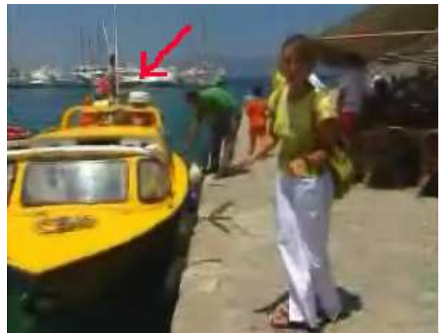
Figure 1: A case of equivalence : “...the yellow taxi-boats...”

In order to further illustrate these multimedia relations, let’s consider the following cases from figures 1 to 4, all of which come from a travel documentary (TV programme in English). Figure 1 depicts a case of equivalence : the narrator refers to yellow taxi-boats that are being used for island hopping in some Greek islands and the corresponding keyframe of the video actually depicts these boats. The image of the boat and the corresponding noun phrase refer to the same entity, the former through visual means, the latter through language.