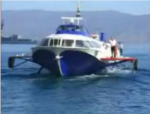
Figure 2: A case of non-essential complementarity : “...we are heading to Patmos...”

the island. Therefore, the image depicts the means through which the narrator is “heading to” the island which is not known through the use of the verb “head to”. In this case, the contribution of the image to the multimedia message is complimentary to the information provided by the speech, though not essential.